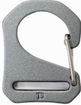
Scratch resistant surface