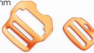
Dual Slot 25mm