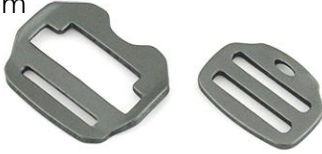
Single Slot 25mm