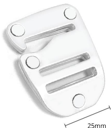
Two aluminum layers fixed with 4 oversize rivets

Extraordinary design makes its use best with outdoor and tactical products and any other products that can pull off its innovative style